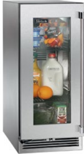
Glass Door Model

HP15RS-3 15" INDOOR MODEL HP15RO-3 15" OUTDOOR MODEL