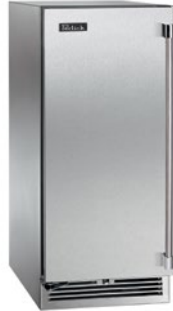
Solid Door Model