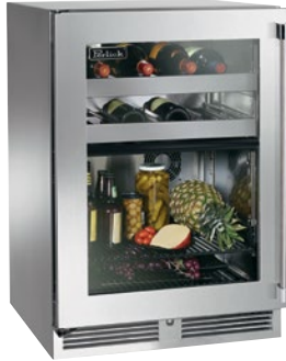
Glass Door Model

HP24CS-3 24" INDOOR MODEL HP24CO-3 24" OUTDOOR MODEL