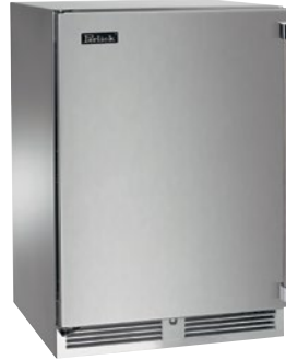
Solid Door Model